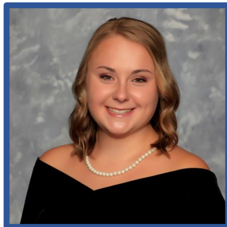
Mill Creek HS