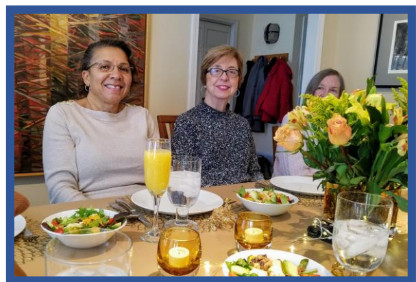
Brunch for 10 at Chez Presson