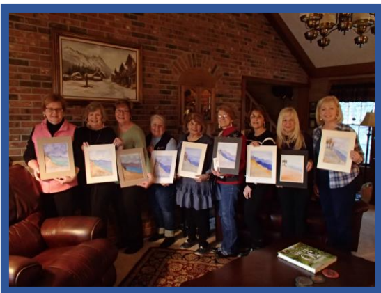
Paint and Sip Party